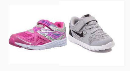
GYM SNEAKERS Only to be worn in the gym