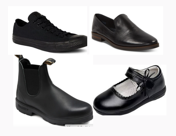
INDOOR SHOES Only to be worn in the school.